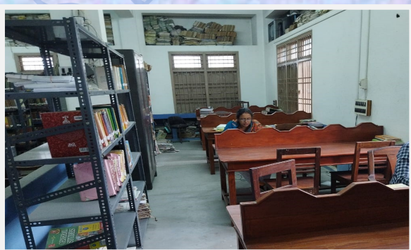
Teacher's Reading Room at Library

Central Library: Since 1965, the year of the establishment of the College, the College Library has been working as the resource centre of the institution. Continuously the Library is emerging in different aspects like its documents, users, services, etc. and simultaneously this Library has established itself as the heart of the institution in the context of resource sharing. Almost fifty thousand documents including textbooks, reference books, novels, etc., competitive examination books, journals, periodicals, maps, and previous year question papers are there in our Library. Two separate reading rooms for students and staff are there. Since 2016, physical description resources have been managed through KOHA, the integrated Library Management Software (ILMS), and since 2022, the College ILMS has been on the cloud. That means users from any corner of the world could benefit through Web-OPAC. We do have membership of the N-List (INFLIBNET) repository from where the users of the library can access lots of e-books and e-journals from different publishers or databases. Books of the Library are arranged and followed by Dewey Decimal Classification.