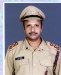
NCC Commanding Officer