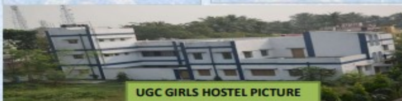
UGC GIRLS HOSTEL PICTURE

Online Helpline No. 7001979100/9434140869